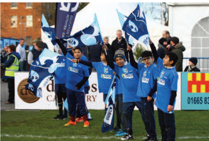
A guard of honour at Bedford Blues RFC