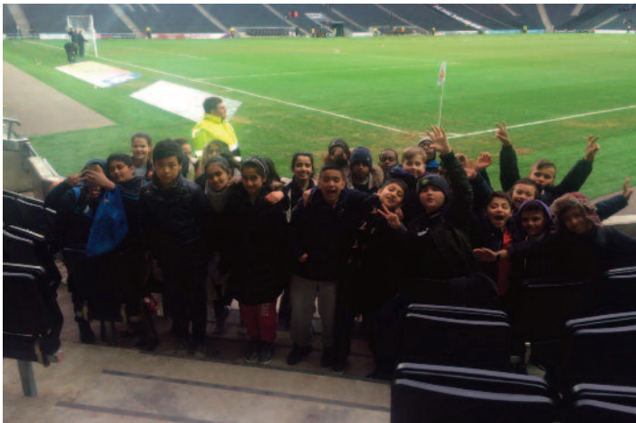
Enjoying the day at Watford FC

To date trips have included football at MK Dons and Watford, where they took part in a two-hour training session, 20/20 cricket at Northampton and forming a guard of honour for Bedford Blues rugby team as they came onto the pitch at a recent game.